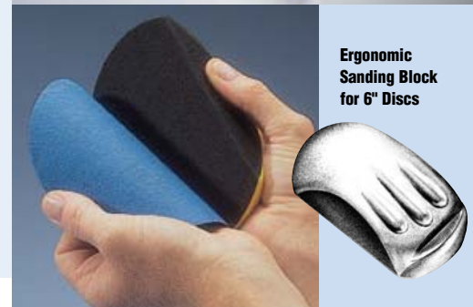
Ergonomic Sanding Block for 6" Discs