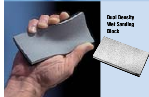
Dual Density Wet Sanding Block